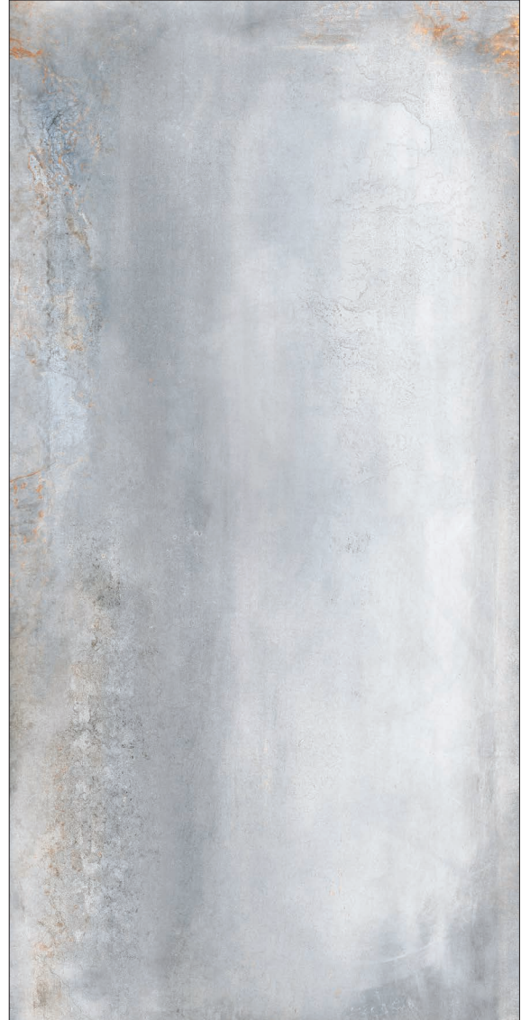
30.8 x 61.5 cm (12" x 24") Matte EX.OX.TTN.1224.MT