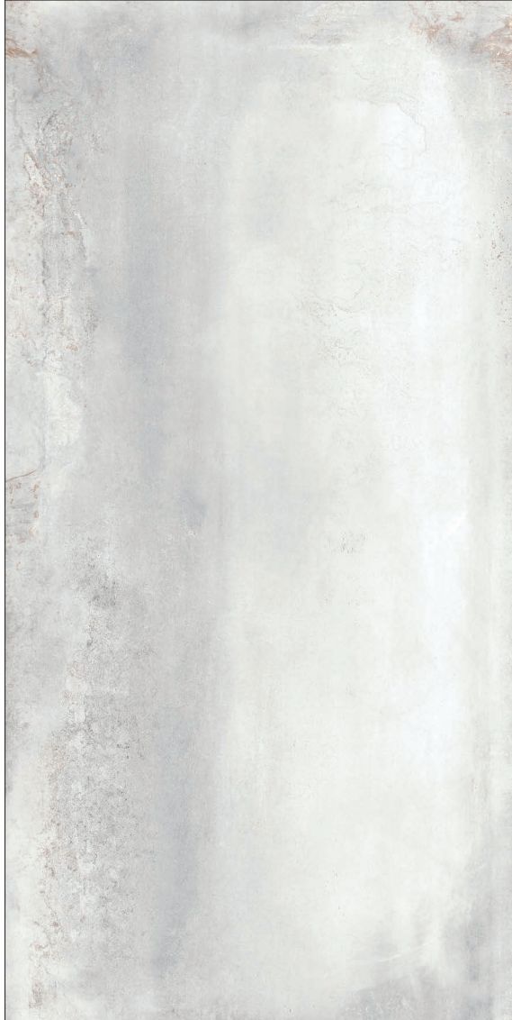
30.8 x 61.5 cm (12" x 24") Matte EX.OX.LHM.1224.MT